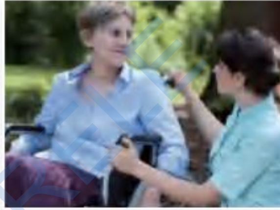
nursing home volunteer

What are their responsibilities as volunteers?