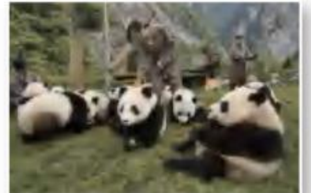
nature reserve volunteer