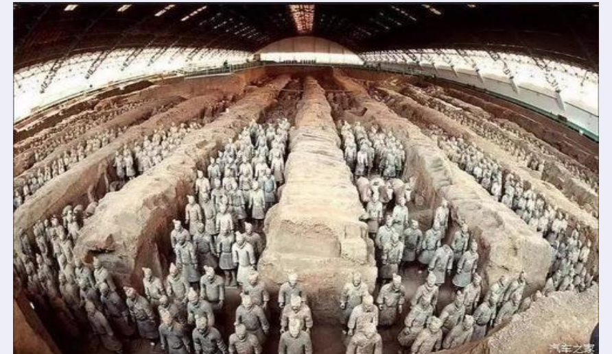
④ Terra Cotta Warriors