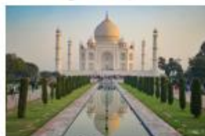
③ Taj Mahal