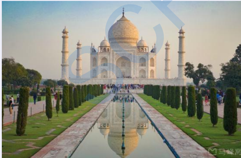
③ Taj Mahal