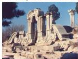
① Yuan Ming Yuan

Practice: Step 1: Find the similarities that are shared by the four tourist attractions.