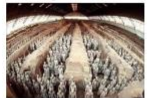
④ Terra Cotta Warriors

Similarities shared by the four tourist attractions: