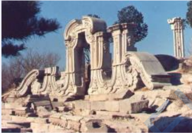
① Yuan Ming Yuan