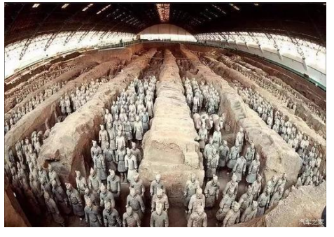
(4) Terra Cotta Warriors