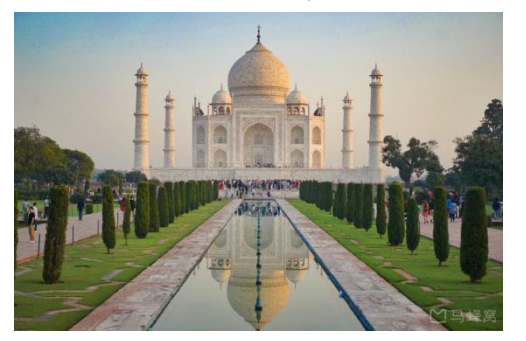
③ Taj Mahal