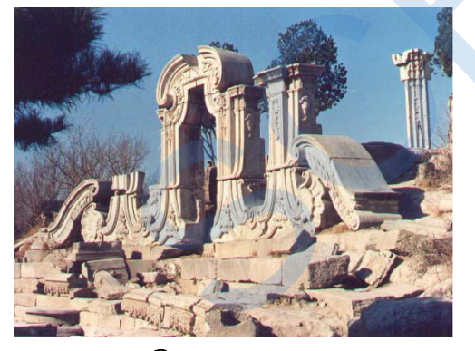
(1) Yuan Ming Yuan

Practice: Step 1: Find the similarities that are shared by the four tourist attractions.