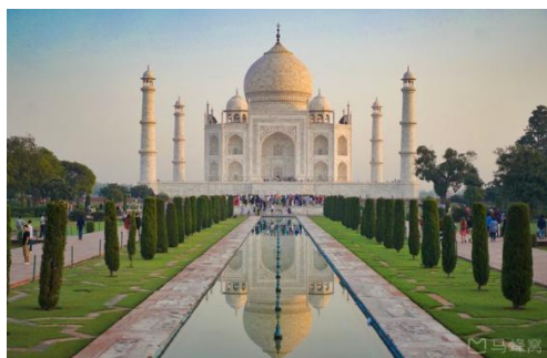
③ Taj Mahal