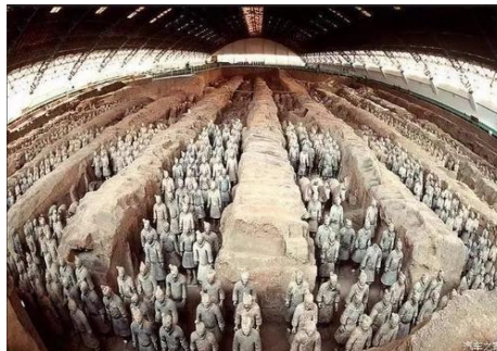
④ Terra Cotta Warriors