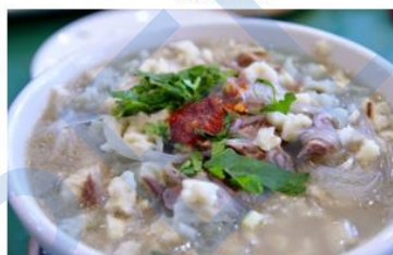
Yang Rou Pao Mo