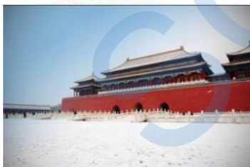
Tian'an Men Square