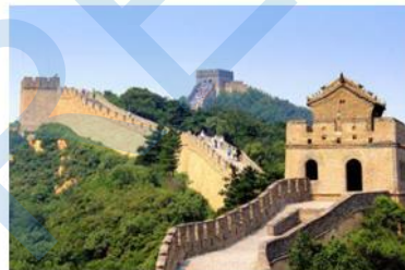
the Great Wall