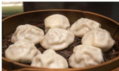
Ji Ming Steamed Dumpling