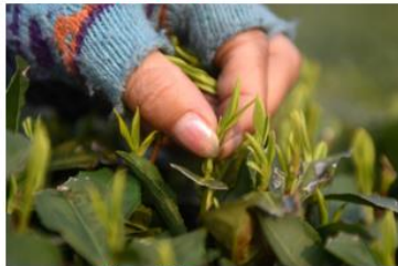
Silk and Tea